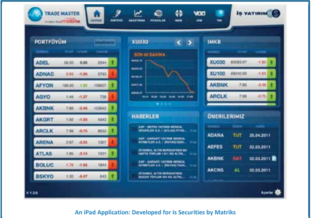
An iPad Application: Developed for Is Securities by Matriks

Matriks clients include: Garanti Bank (and Securities department); Is Bank (and Is Securities); Ak Bank (and Ak Securities); Finans Bank (and Finans Invest); Yapi Kredi Bank and Securities; Eczacibasi Securities; Deniz Bank (and Deniz Securities); ING Bank (and ING Securities); and many more.