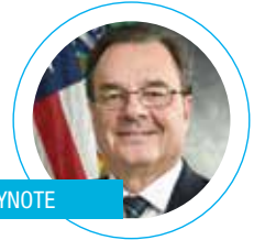
Joseph M. Otting Comptroller, U.S. Office of the Comptroller of the Currency