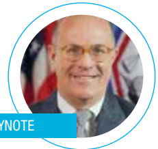
Sheila C. Bair Former Chairman, U.S. Federal Deposit Insurance Corporation